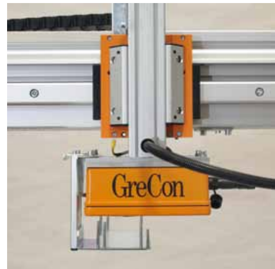
BWQ calibration unit in operation