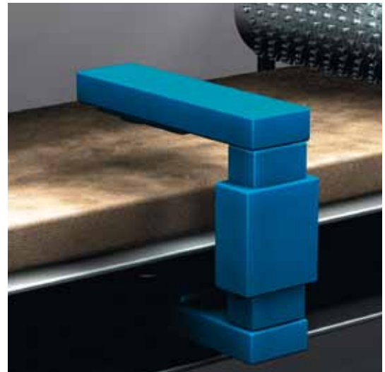
Detailed view of BWS 5000

In forming stations or at dosing or forming belts of wood based panel productions.