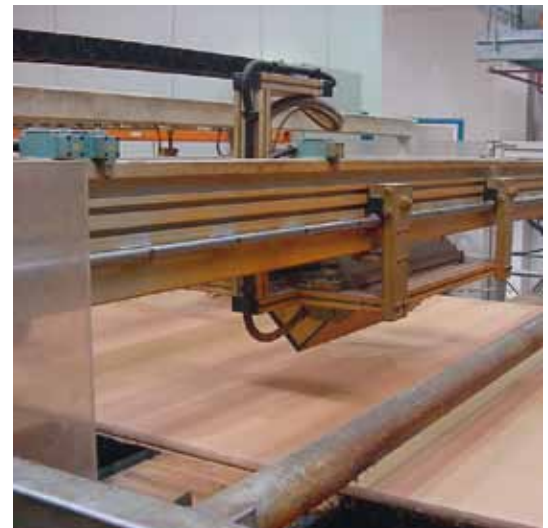
Inline raw density measurement in MDF industry